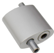
SCL-ALG AUXILIARY LOOP GRIP FOR AIRCRAFT SUSPENSION CABLE, 1/16"