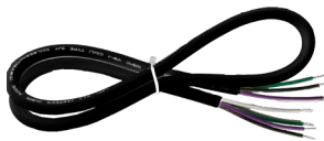
SCL-6FT-SJTW18/6-BK WHITE 6 FT. CORD, SJTW 18 AWG 6-CONDUCT ( WH/BK/GN/PU/GY + RED FOR EMERGENCY))