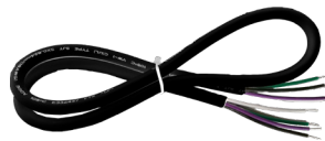
SCL-12FT-SJTW18/5-BK WHITE 12 FT. CORD, SJTW 18 AWG 5-CONDUCT ( WH/BK/GN/PU/GY)