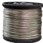
SCL-ASC-1000FT 1/16" 1000 FT. STEEL AIRCRAFT SUSPENSION CABLE