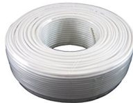
SCL-100FT-SJTW18/6 WHITE 100 FT. CORD, SJTW 18 AWG 6-CONDUCT ( WH/BK/GN/PU/GY + RED FOR EMERGENCY)