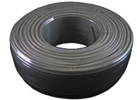
SCL-100FT-SJTW18/6-BK WHITE 100 FT. CORD, SJTW 18 AWG 6-CONDUCT ( WH/BK/GN/PU/GY + RED FOR EMERGENCY)