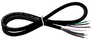
SCL-6FT-SJTW18/5-BK WHITE 6 FT. CORD, SJTW 18 AWG 5-CONDUCT ( WH/BK/GN/PU/GY)